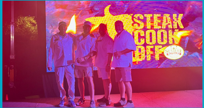
Submitted by Jimmy Herlocker