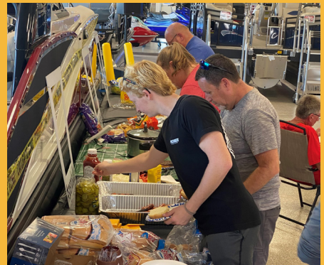
Submitted by Brenda Moots