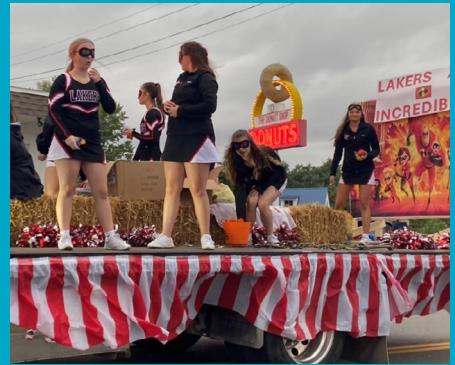
Submitted by Brenda Moots